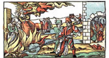
Persecution of witches