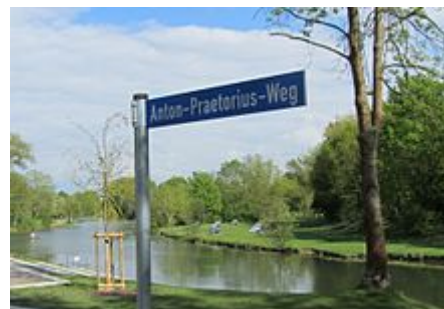
Inauguration of a street name for Anton Praetorius in Lippstadt/ Germany on May 7th 2015

The church of Laudenbach displays a plaque in memory of Praetorius [4] and on May 7, 2015 the city of Lippstadt named a path in his honor